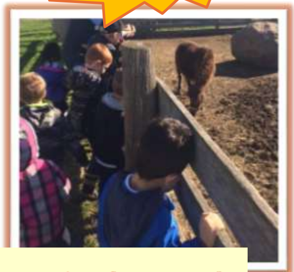
Fieldtrip to Earthbound Kids (JK-Gr. 2)